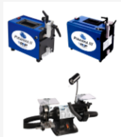
Tungsten Electrode Grinder