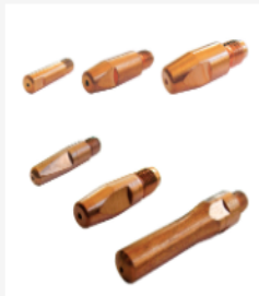
Mig Contact Tips